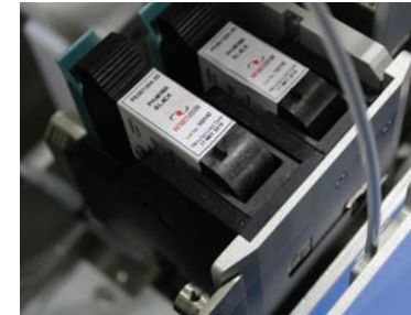
THERMAL INKJET PRINTING